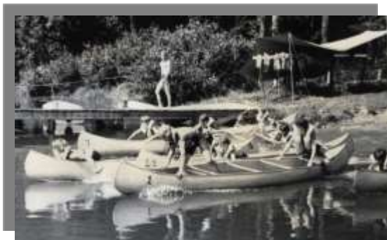
CRM waterfront circa 1970

At our camps it is our aim that all youth be able to enjoy our Waterfront Area. This year we will again be offering swimming lessons aimed at non-swimmers and beginners with the goal of helping the Scout pass his BSA swim test before the end of the week. See the Program Section for the class periods that this will be offered.